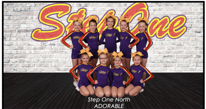
Step One North ADORABLE

CHARDON HEALTHCARE 620 WATER ST CHARDON OHIO 44024