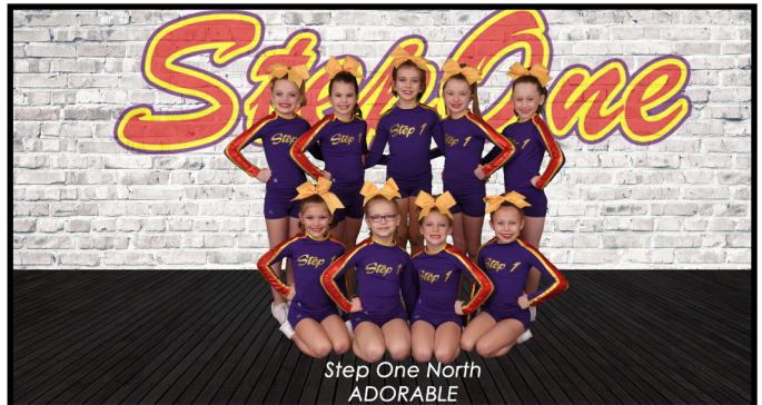
Step One North ADORABLE

CHARDON HEALTHCARE 620 WATER ST CHARDON OHIO 44024